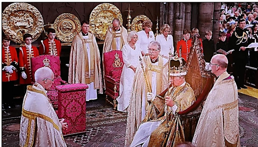
The King is crowned

hosting Live Music in the evening with much singing and dancing enjoyed by many.