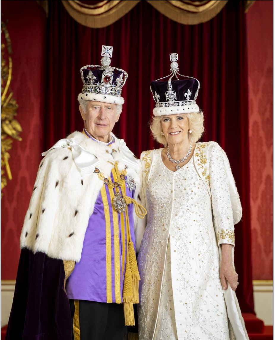
The official photograph